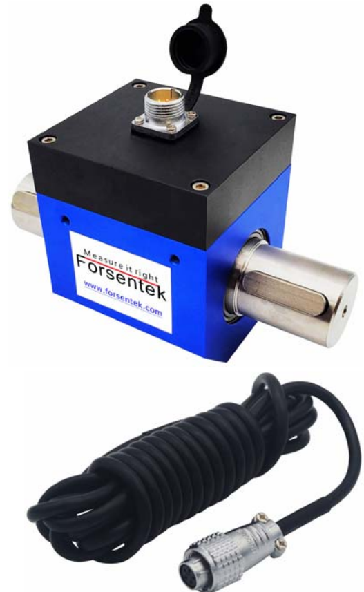
3m cable with mating connector included

• Subject to change without notice / 如有更改,不另行通知